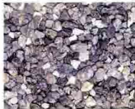
Guyanan Bauxite (Grey)

A wide selection of high performance bauxites, granites and basalts, are available for anti-skid surfacing and traffic management schemes. These products are suitable for heavily trafficked areas, because of their hard wearing and skid resistance properties. Areas of application include, surfacing of major roads, roundabouts, demarcation lanes, paths and cycle ways.