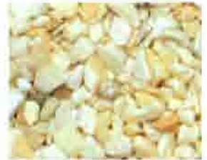
Honey (Jerez) Yellow