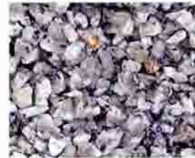
Silver Grey Granite