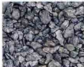
Dark Green Basalt