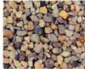
Golden Beach Shingle