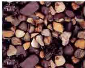
Trent Pea Gravel