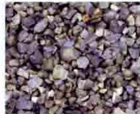
Chinese Bauxite (Grey)