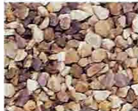
Chinese Bauxite (Buff)