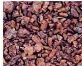
Salmon Pink Granite